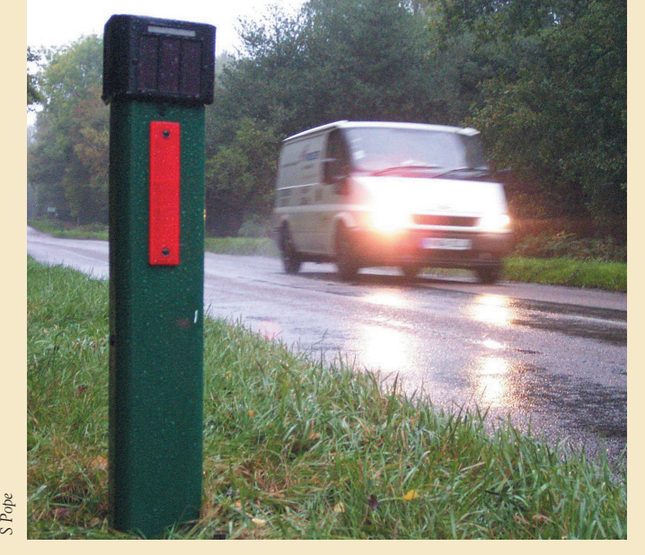
The Ecopillar incorporates accoustic signals and optical flashes from reflected headlights.