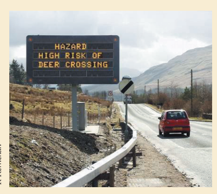
Variable messaging on the A835 in Scotland.

results of the work should also be available later this year.