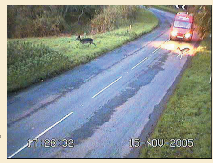
Above and below: Video surveillance is valuable in identifying deer behaviour and the effectiveness of accident reduction measures.