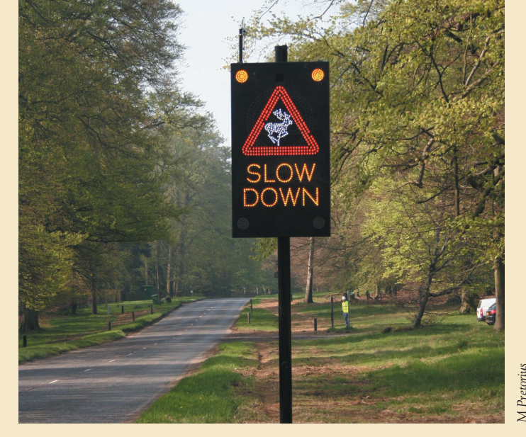
Interactive signage was deployed for the first time this year in Britain.

determine whether deer do actually tend to delay crossing longer after traffic has passed where such devices are present, and also whether any reaction elicited differs either between the devices on test and/or between our different common species of deer. A similar approach to monitoring is being utilised on the B1106 through Thetford Forest in Suffolk, where the County Council is interested in assessing whether rumble strips, in addition to potential reduction of driver speeds, may also have some effect in alerting deer to oncoming traffic<sup>5</sup>.